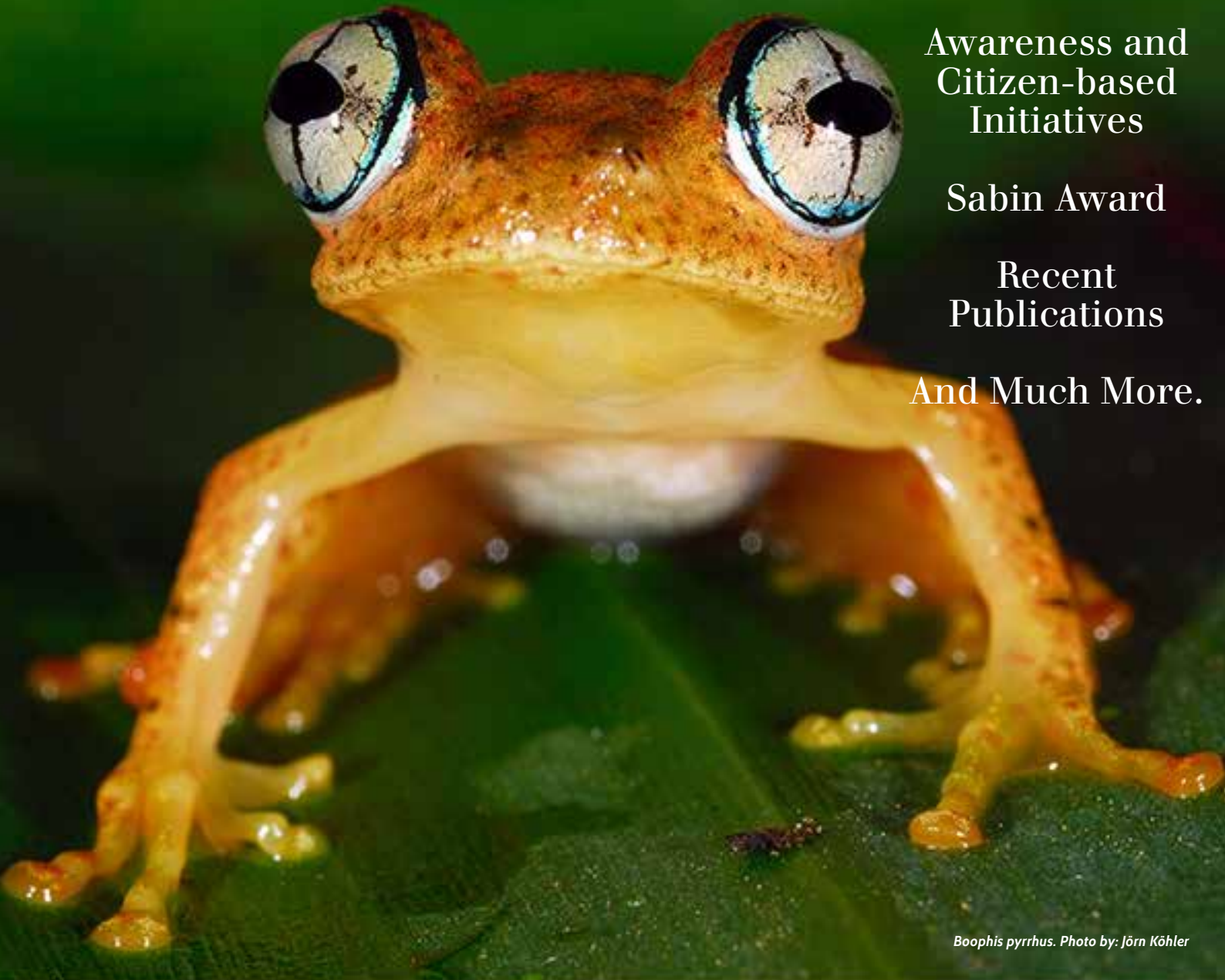
Boophis pyrrhus .